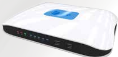
4channel Desktop NVR with POE 1HDD: 2TB Max