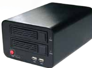
4channel NVR with POE 2HDD: 4TB Max